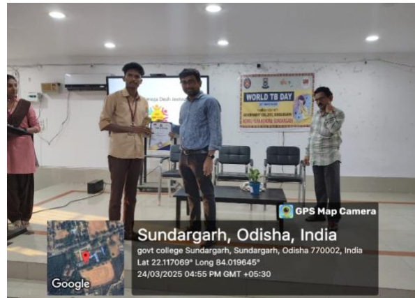
[Date- 24 th March (Monday) Location – B.ED Conference Hall of The NEW BUILDING}