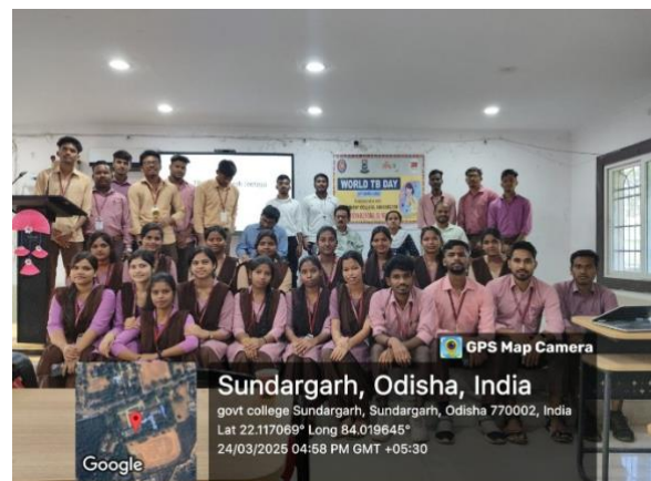
[Date- 24 th March (Monday) Location – B.ED Conference Hall of The NEW BUILDING}